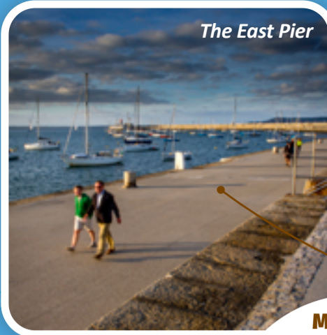
The East Pier