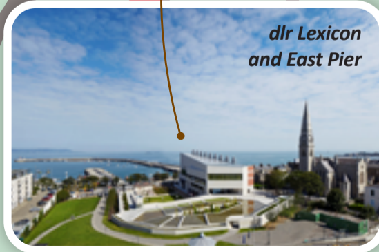
dIr Lexicon and East Pier

James Joyce Museum, Sandycove Beach and Forty Foot 15 mins